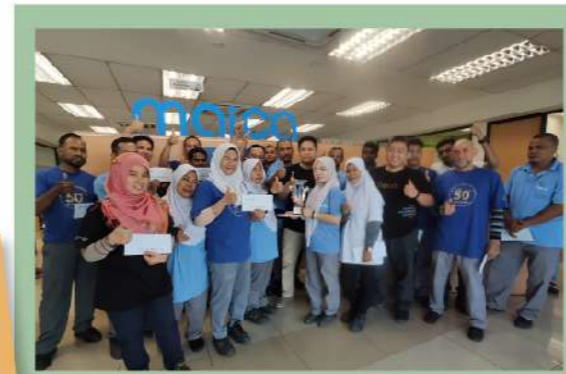
'5s' (Sort, Stabilise, Shine, Standardise and Sustain)