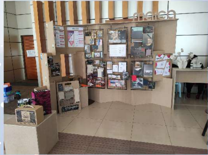
Maica was given a booth space at the foyer of Dewan Tunku Syed Putra. The exhibition booth was built entirely with in-house resources.

Maica Laminates is honoured to be the main sponsor for this event.